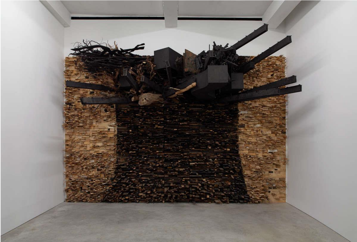
Leonardo Drew. Number 130 , 2009. Wood and mixed media, 134 x 132 x 20 3/4 inches. Collection Pérez Art Museum Miami, gift of Beatriz and Claudio Giardinella. © Leonardo Drew. Image courtesy Sikemma Jenkins & Co., New York

The Gift of Art is organized by PAMM Chief Curator Tobias Ostrander .