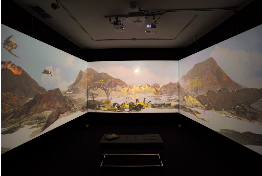
Installation view, TRANSFER Download in Santa Fe at the Thoma Foundation (2018-2019)