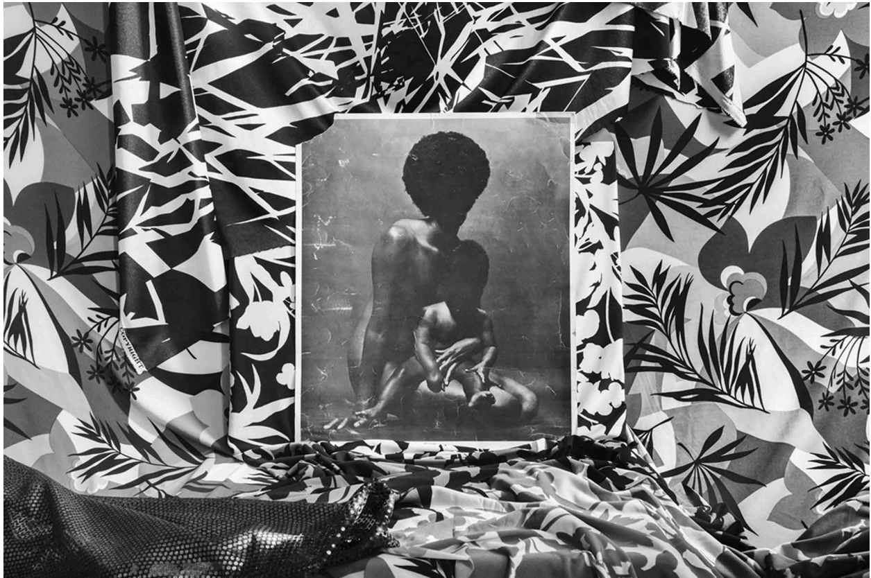
Keisha Scarville. Within/Between/Corpus (1) , 2020. Photography.

Among the many topics discussed are the role of collaboration in photography and archival practices, the relevance of the Caribbean in photography history, and current photographic debates around materiality, ecology, and climate change.